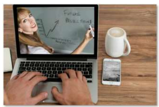
but that's going to take forever.

Regardless, animated video using whiteboard tools are very popular precisely because they're effective. While you can create these without a voice over, the more powerful ones have a voice track. These are usually used for explainer videos or for product reviews.